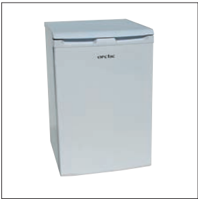
Racitor (140 l) Cod 025 010 070 010 (55 x 61 x 84 cm)