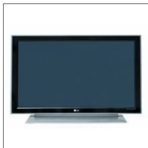
TV Plasma Cod 025 010 130 040