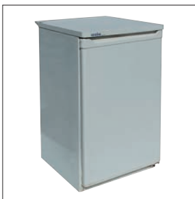
Frigider ARCTIC (180 l) Cod 025 010 070 020