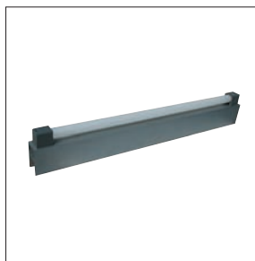
Corp fluorescent tip SS30 cu un tub D-170 Cod 019.010.190.000