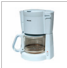
Filtru de cafea Cod 025.010.120.010