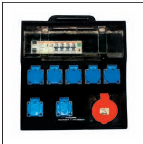
Panou Electric 380V/220V Cod 019.010.265.000