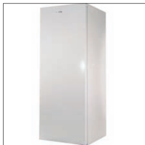
Frigider ARCTIC 255 l Cod 025 010 020 199