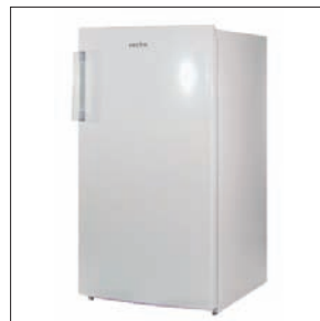
Frigider ARCTIC FB 155 Cod 025 010 020 198