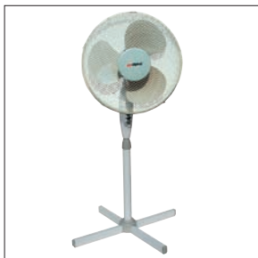
Ventilator cu picior Cod 025.010.500.020