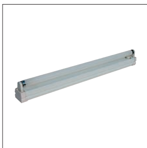
Corp fluorescent tip SS30 cu un tub D-170 - A Cod 019.010.190.001