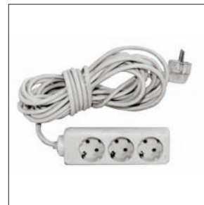
Prelungitor 230V, 10A, 5m Cod 019.010.279.000