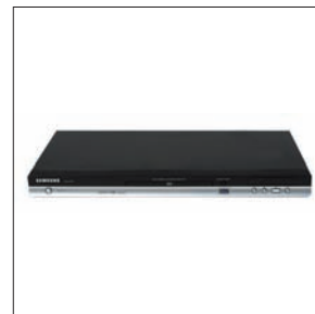
DVD Player Cod 025 010 130 030