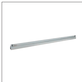
Lampa fluorescenta FIA cu instalatie electrica completa 1x40W Cod 019.010.110.000