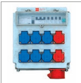
Panou Electric OCTANORM Cod 019.010.275.000