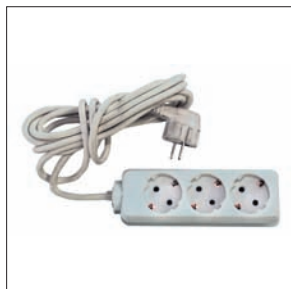
Prelungitor 230V, 10A, 3m Cod 019.010.277.000