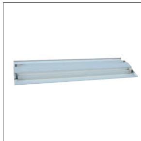
Corp fluorescent tip OCTANORM cu doua tuburi D-171 Cod 019.010.200.000