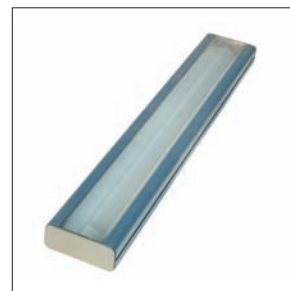
Corp fluorescent tip SYMA STAR Cod 019.010.200.001